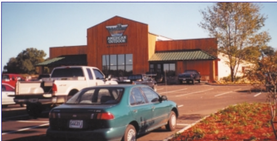
American Outdoor Adventures has 15,200 sq. ft. of retail and office space in Albany, Georgia.